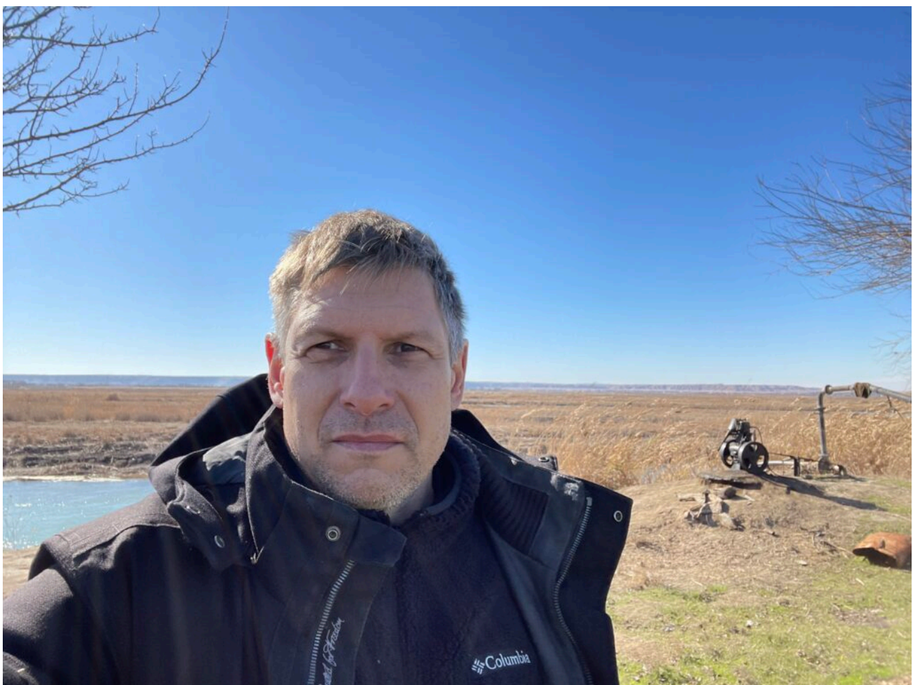
s River 2022

On a daily basis, the work of an NGO like MAG is therefore impacted by local logics, which are the relations between the Local Administration and the tribes, between the tribal groups, the bureaucratic functioning of the Local Administration, the economic crisis linked drought and inadequate governance, not to mention the security threat still posed by Daesh. But its activity can be brutally interrupted by a new Turkish offensive or the withdrawal of American forces from northeastern Syria. It is therefore important in future scenarios to link internal and external determinants, because the deterioration of the economy and/or social relations can also be a prerequisite for an external offensive.